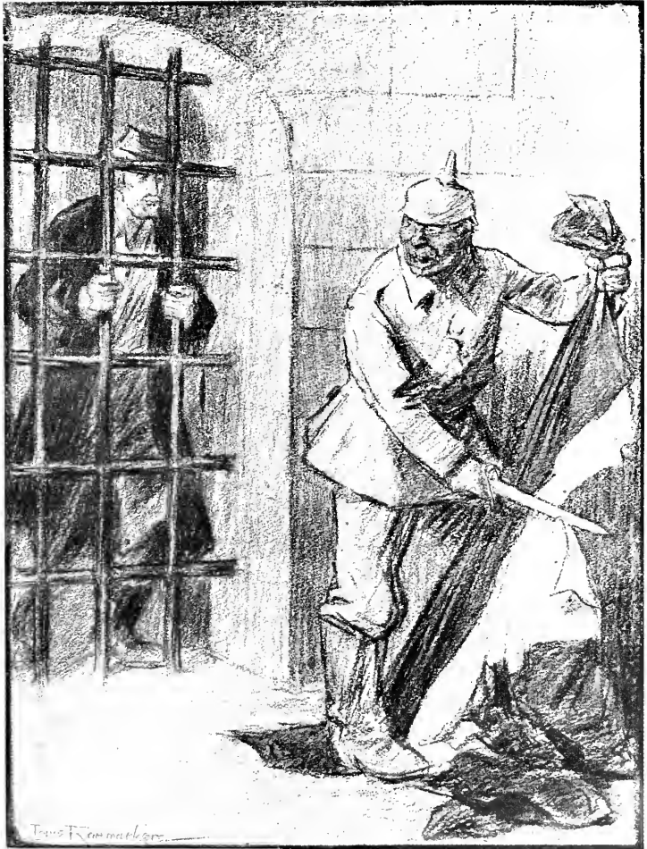
German respect for the Flag.